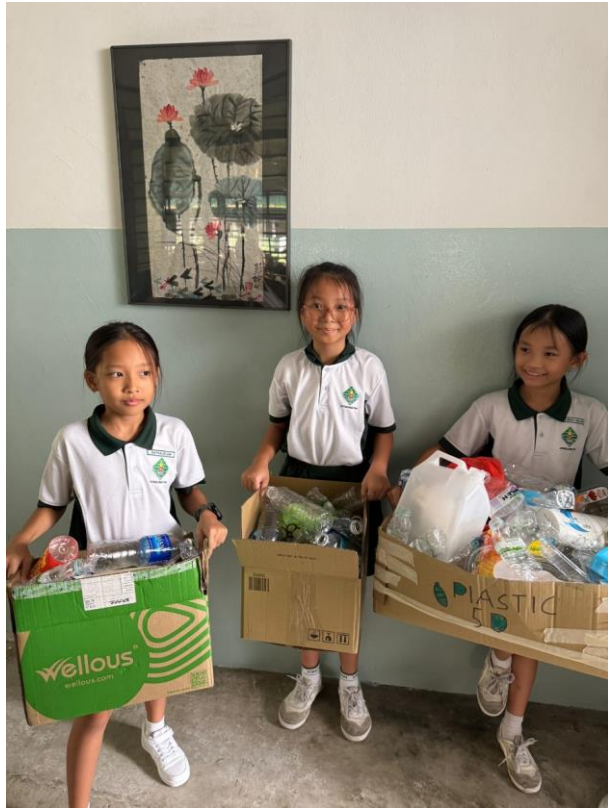
Eco Leaders sorting out the recyclables – making sure they are clean and dry.